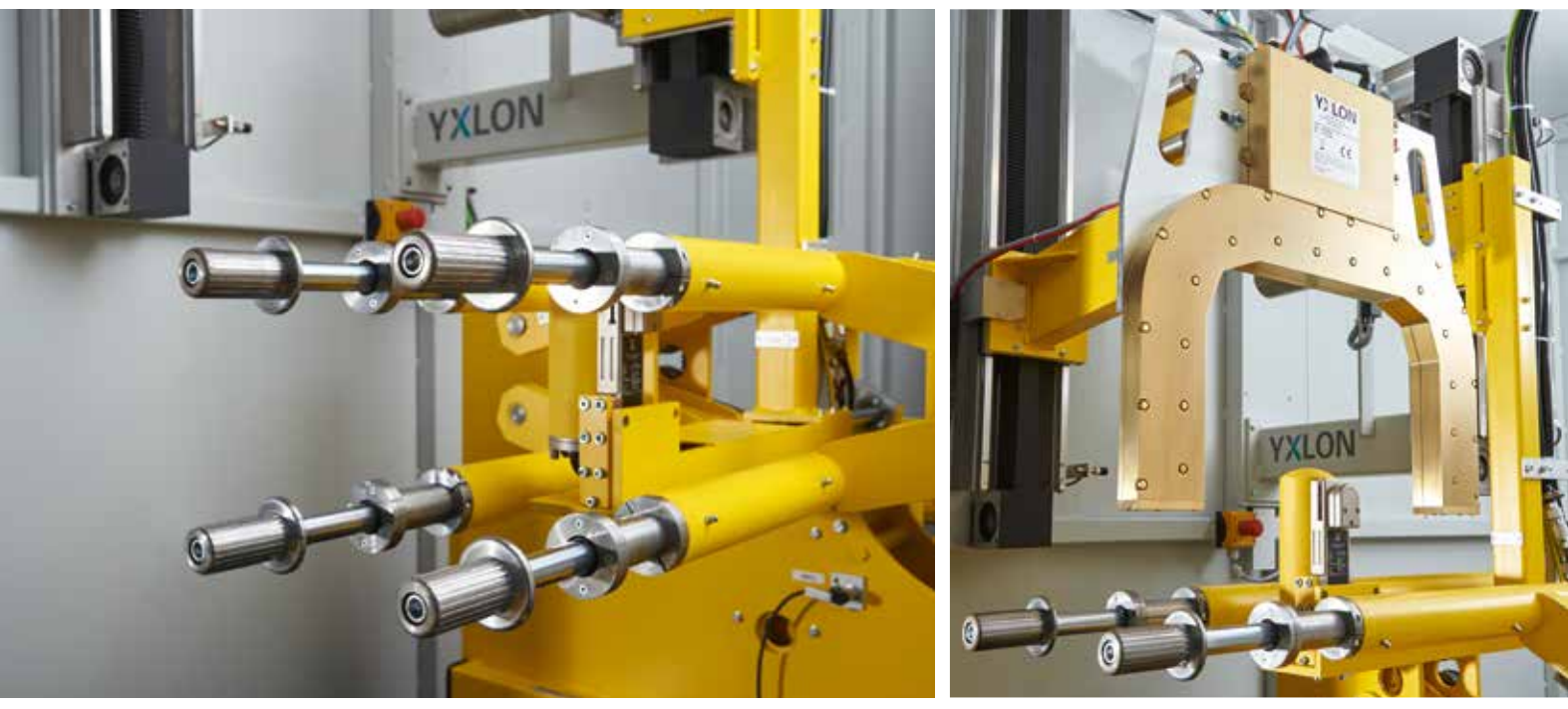
The four-spindle manipulation ensures for reliable and repeatable inspection results.