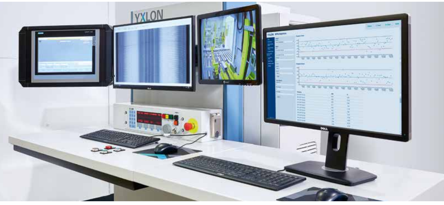
Production process improvements with high-quality x-ray sensor data to be imported into your SPC system