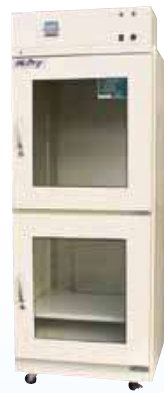
MB 301 300L (2-door)