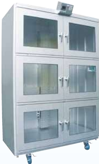
MB 1001 1200L (6-door)

This low-temperature, low-humidity baking oven can be used for low-humidity PCB storage and for dehumidifying IC packages with tape reels that cannot be hot-baked.