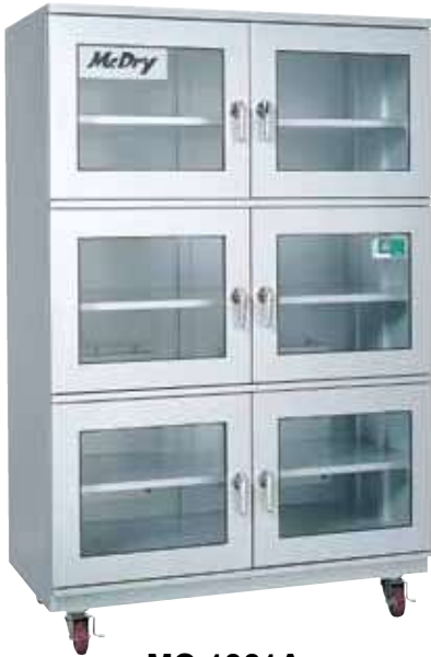
MC-1001A 43 cf (6-door type)

Door Opening / Closing: Once every 0.5 - 2hrs.