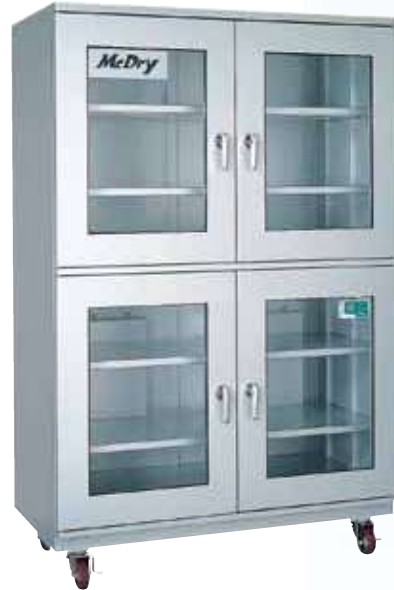
MC-1002A 43 cf (4-door type)