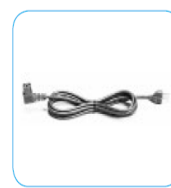
POWER CORD AC100~120V...CP1-100 AC200~240V...CP1-200