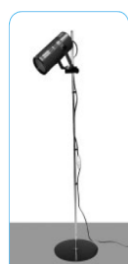
Floor Stand ST-1500C