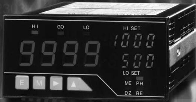
Display multiple type (A5X2X-XX)