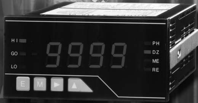
Display single type (A5X1X-XX)