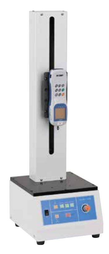
*Digital force gage is optional.