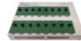
Example of attaching dedicated adapters (TK series)

* The programming time depends on devices and environments.