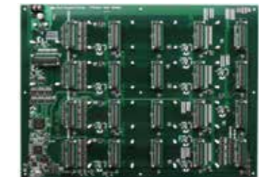
Example of a custom burn-in board