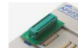
Example of a DIP unit + adapter