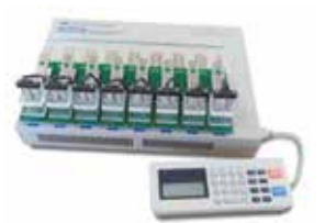
Example of attaching adapters