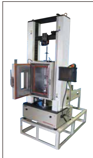
Tester with thermostatic oven image